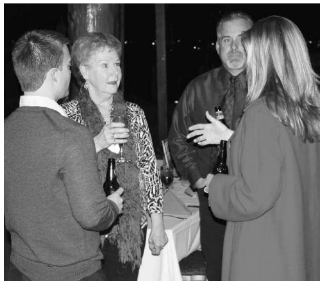
Representatives from RCP Block.