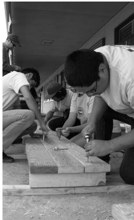
ACE Mentor Students from Southwest High School helped construct and place the many planter boxes