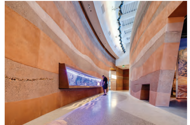
900 Innes (San Francisco, CA) (Lithocrete & TB Penick Coloration System), 9th Street Enhancements (Imperial Beach, CA) (Lithomosaics), UC San Diego - Theatre District Living and Learning Neighborhood (San Diego, CA) (Lithocrete & Quarried Stone Finish), University of San Diego - Wellness Center (San Diego, CA) (Lithocrete & Quarried Stone Finish), I5 Vista Point (Cardiff, CA) (Lithocrete), Valley of Fire Visitor Center (Overton, NV) (Lithocrete Sedimentary Walls & Epoxy Cement System Flooring)

For more than a century T.B. Penick & Sons, Inc. has been providing owners, architects, contractors, and specifiers like you, with the most advanced technologies in concrete materials and finishes. We enthusiastically support your vision, bringing quality, craft, and long-term value to those projects you wish to create. We look forward to working with you, ensuring that your design intent is accurately realized each and every step of the way.