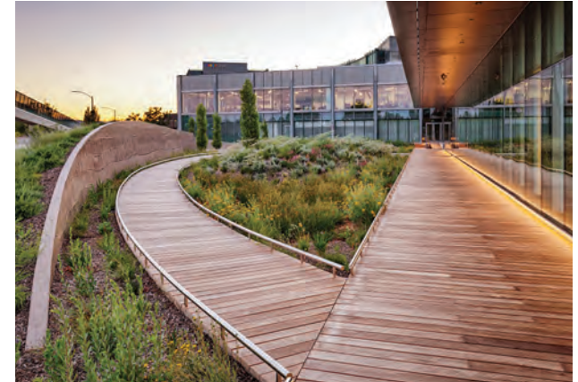
Old Town San Diego State Historic Park (San Diego, CA) (Lithomosaics), Directors Place – Interior (San Diego, CA) (Lithocrete Sedimentary Walls & Epoxy Cement System), Directors Place – Exterior (San Diego, CA) (Lithocrete Sedimentary Walls & Lithocrete), The Boardwalk at Science Center (San Diego, CA) (Quarried Stone Finish), San Diego Symphony - The Rady Shell at Jacobs Park (San Diego, CA) (Quarried Stone & Honed Concrete), Sunnyvale Sedimentary Wall (Sunnyvale, CA) (Lithocrete Sedimentary Walls)

For more than a century T.B. Penick & Sons, Inc. has been providing owners, architects, contractors, and specifiers like you, with the most advanced technologies in concrete materials and finishes. We enthusiastically support your vision, bringing quality, craft, and long-term value to those projects you wish to create. We look forward to working with you, ensuring that your design intent is accurately realized each and every step of the way.