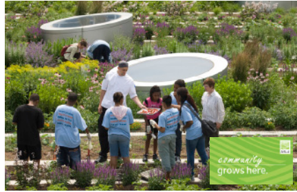
ASLA 2010 General Design Honor Award. Rooftop Haven for Urban Agriculture, Hoerr Schaudt Landscape Architects