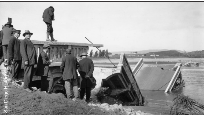
San Diego River bridge near Old Town after the 1916 flood