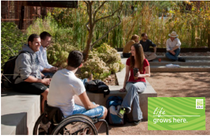
ASLA 2010 Professional General Design Honor Award. Underwood Family Sonoran Landscape Laboratory. Ten Eyck Landscape Architects, Inc.