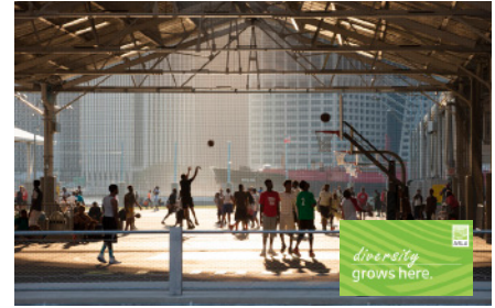
ASLA 2018 Professional General Design Award of Excellence. Brooklyn Bridge Park, Michael Van Valkenburg Associates, Inc.

“An incredible thing called life grows in the spaces we create. Help us tell that story.”