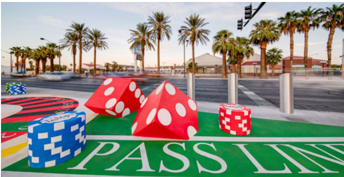
Clockwise from left - 33 Tehama (San Francisco, CA) (Honed Lithocrete & Stained Litho-Thin Tech), Kona Kai (San Diego, CA) (Stained Lithocrete-Glass), Miller Park Splash Pad (Fontana, CA) (Quarried Stone Finish & Lithomosaics), Las Vegas Show Girls Sign (Las Vegas, NV) (Stained, White Cement Lithocrete-Glass), Fern Street (Cambridge, MA) (White Cement Lithocrete-Glass)

For more than a century T.B. Penick & Sons, Inc. has been providing owners, architects, contractors, and specifiers like you, with the most advanced technologies in concrete materials and finishes. We enthusiastically support your vision, bringing quality, craft, and long-term value to those projects you wish to create. We look forward to working with you, ensuring that your design intent is accurately realized each and every step of the way.