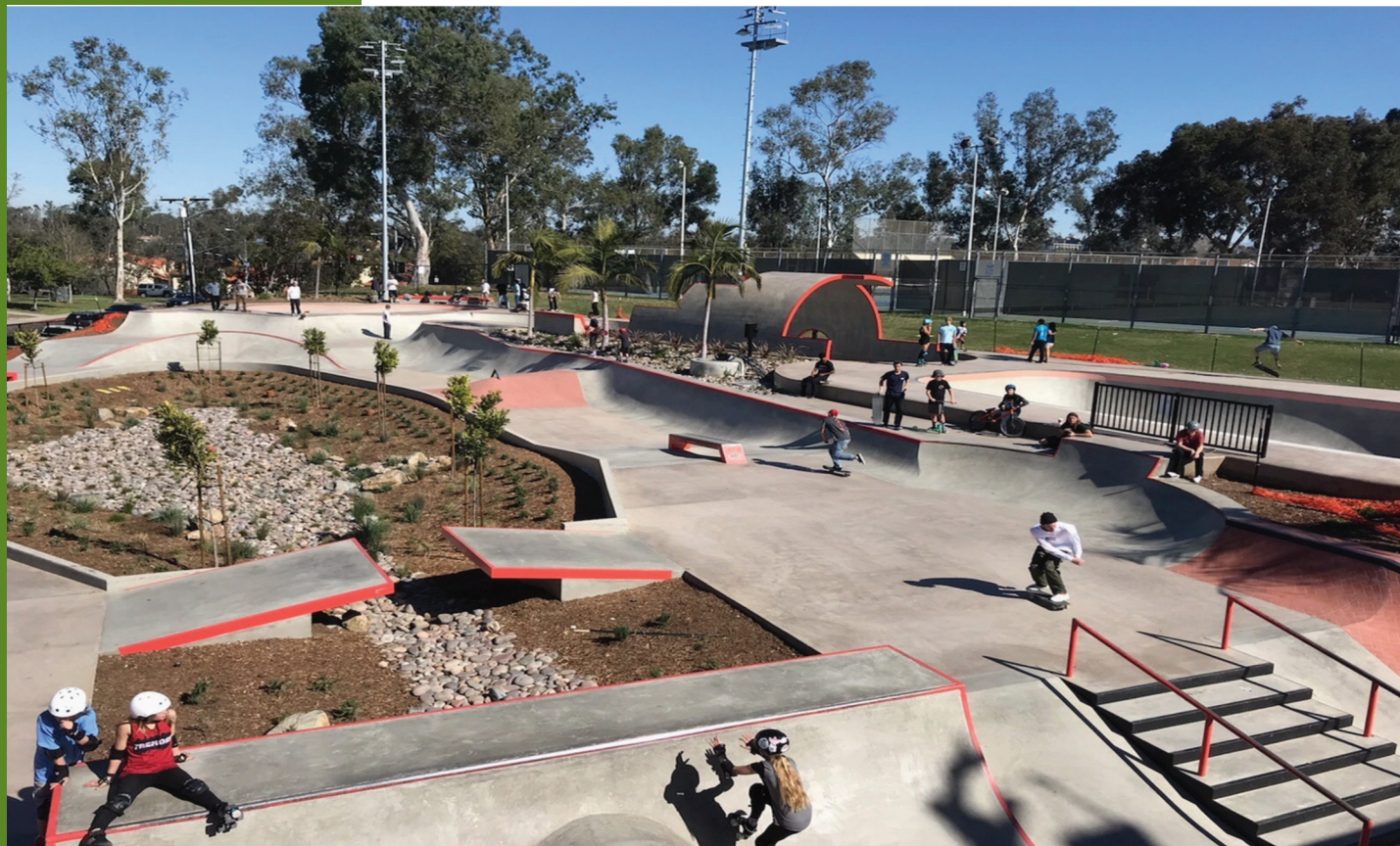
Linda Vista Skatepark, 2018 Design Awards - Honor Award - Schmidt Design Group