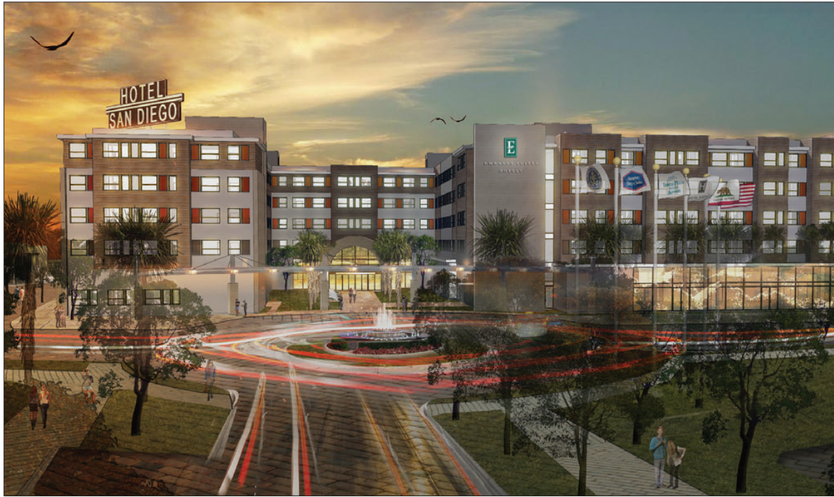
An artist's rendering of the hotels planned for Liberty Station, which may be completed in 18 months.

This is the only Liberty Station development on the east side of the boat channel that connects to the North San Diego Bay. The hotel site