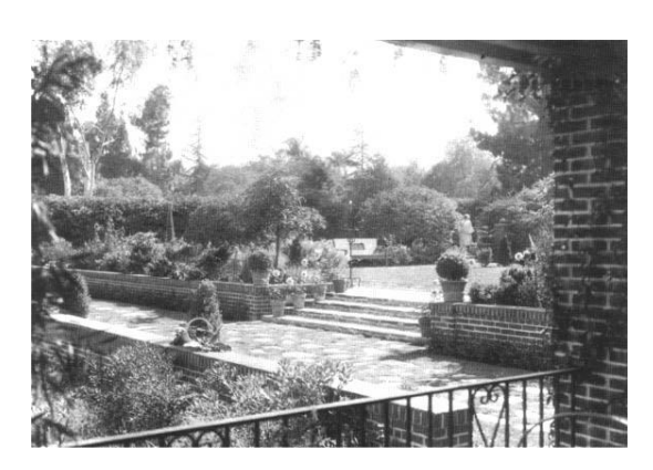
MARSTON HOUSE GARDEN BALBOA PARK – 1930s