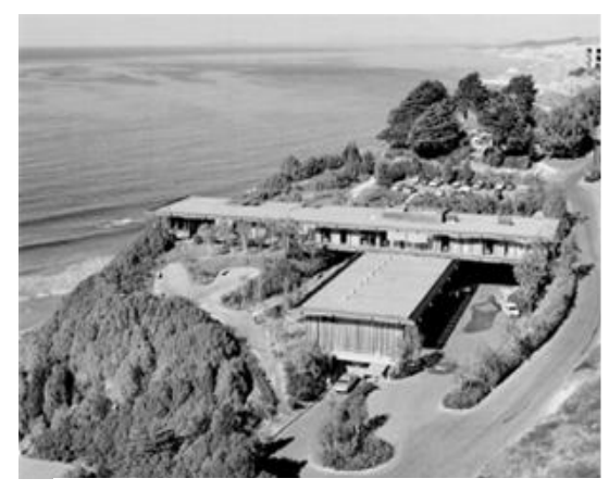
SCRIPPS INSTITUTE OF OCEANOGRAPHY - 1963