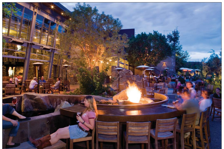
Stone Brewing World Bistro and Gardens.