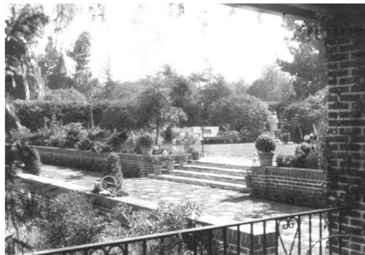
MARSTON HOUSE GARDEN BALBOA PARK – 1930s