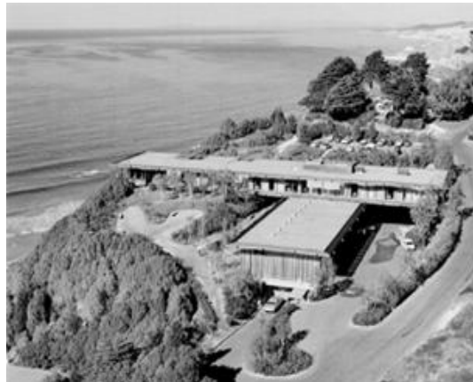
SCRIPPS INSTITUTE OF OCEANOGRAPHY - 1963