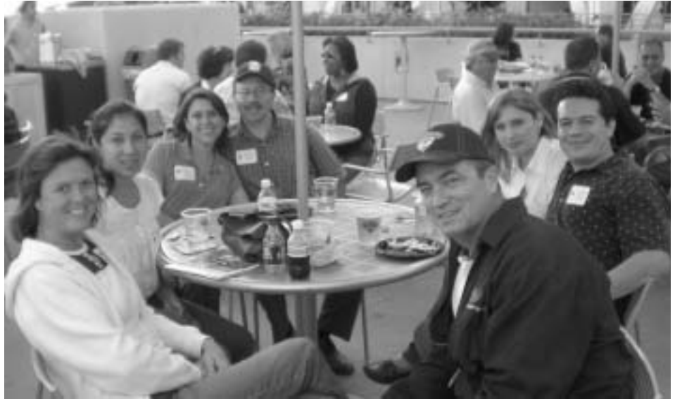
ASLA San Diego members enjoyed a tour of East Village and a night at the ballpark on July 19. See page 3 and visit the website at www.asla-sandiego.org for more photos.