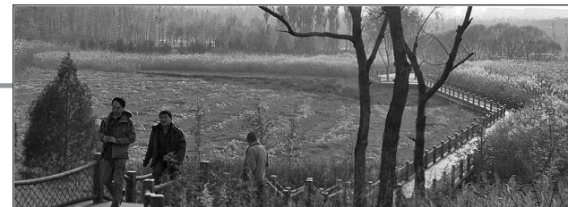
Andropogon's design for Dragon Lake at the 2008 Beijing Olympics

However, successful lectures require your support. We have two levels of sponsorship and encourage you to review the numerous benefits you'll receive by sponsoring. Please visit the ASLA website where you can download the sponsorship form at www.asla-sandiego.org/lecture_pledge_form.pdf or email us at ASLASD@sbcglobal.net