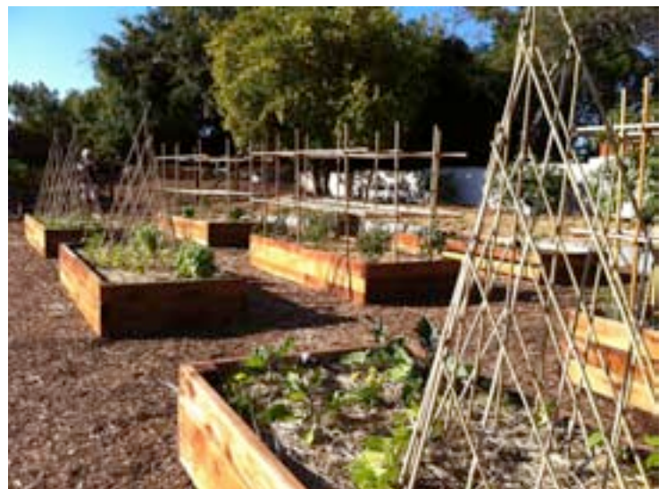
Our goal raised beds! These is an excellent example by Urban Plantations

Construction Days Saturdays 11/5/2011 & 11/12/2011