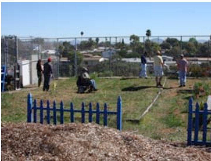
The project site, on the school campus above Ruffin Canyon